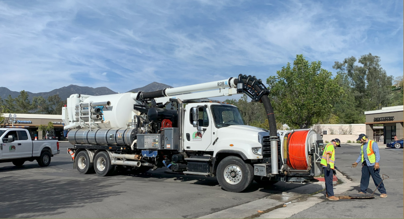
TCWD staff cleans a sewer line using a vactor truck to break up and remove debris.