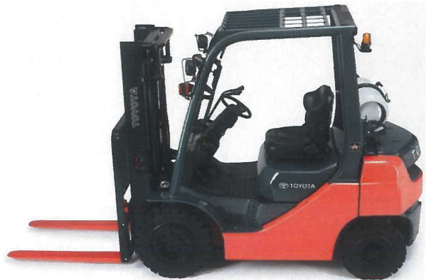
Photo may portray optional equipment not included in your quotation.